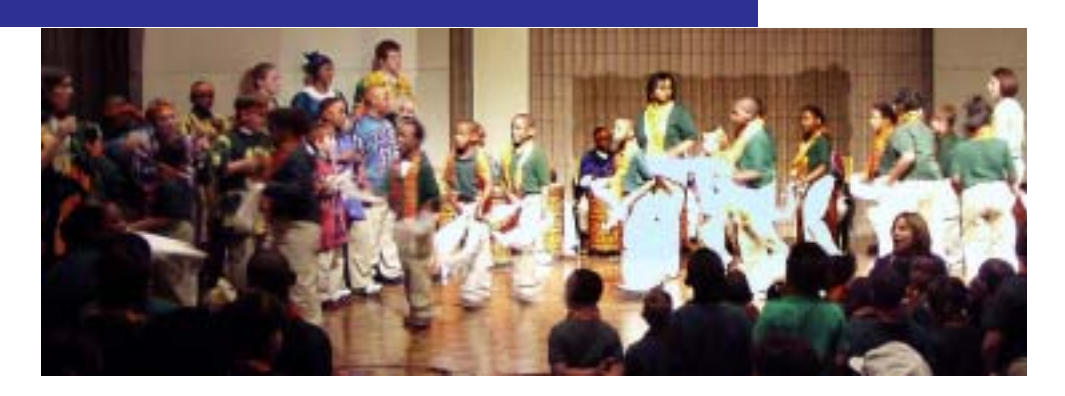
CHESAPEAKE CONFERENCE CENTER